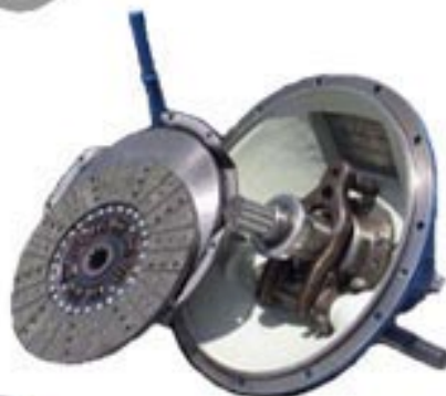
AUTOMOTIVE STYLE MECHANICAL PTO'S