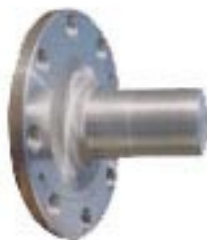
STUB SHAFT DRIVEPLATES