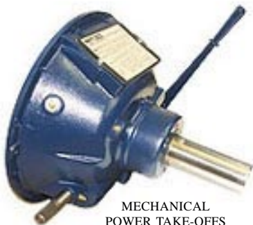
MECHANICAL POWER TAKE-OFFS