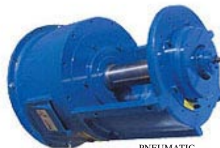
PNEUMATIC POWER TAKE-OFFS