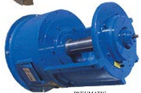
PNEUMATIC POWER TAKE-OFFS