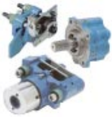
CONSTRUCTION PARK BRAKES