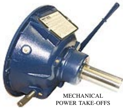
MECHANICAL POWER TAKE-OFFS