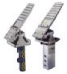
HYDRAULIC VALVES AND CONTROLS

* WPT * DESCH * ROCKWELL * GOODYEAR * AMERITOR * CARLISLE * WELLMAN *